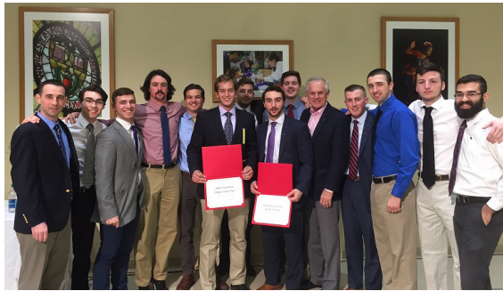
Pictured above are Pi Iota Brothers at the 2017 Greek Awards Night

Fraternally Yours, F.A. Morse Association